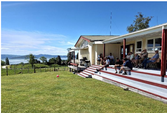
View looking south to Lake Rotorua